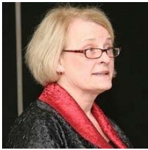
In the News: Library awarded $500k Grant from NEH