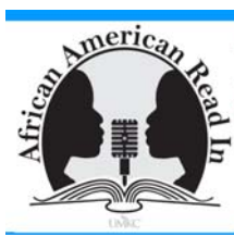
24th Annual National African American Read-In - Feb. 19